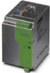
QUINT DC/DC converter, primary-switched, input: 24 V DC, output: 24 V DC/10 A

Please be informed that the data shown in this PDF Document is generated from our Online Catalog. Please find the complete data in the user's documentation. Our General Terms of Use for Downloads are valid ( http://phoenixcontact.com/download )